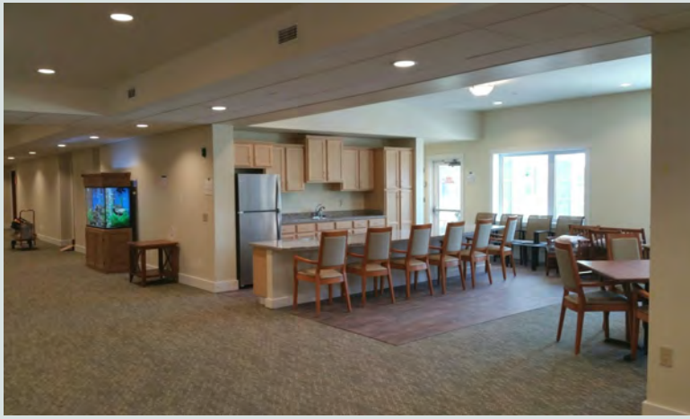
(Left Photo) The furnishings are being added to our state of the art Memory Care Community.