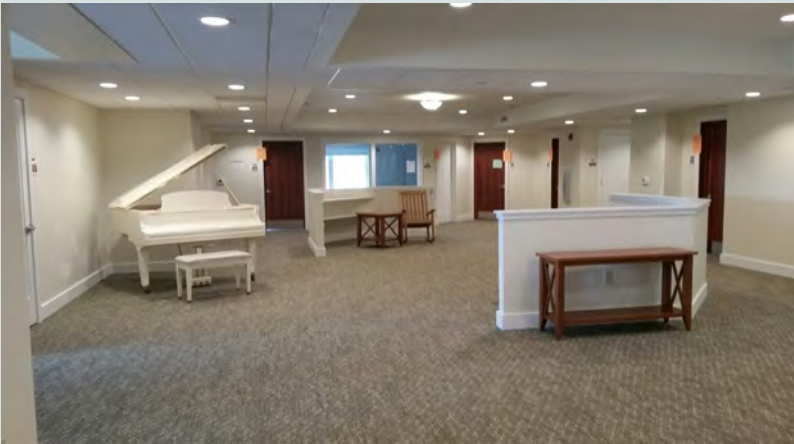
(Above Photo) Beautiful sounds will come from the Gardens Memory Care when this baby grand piano is played!