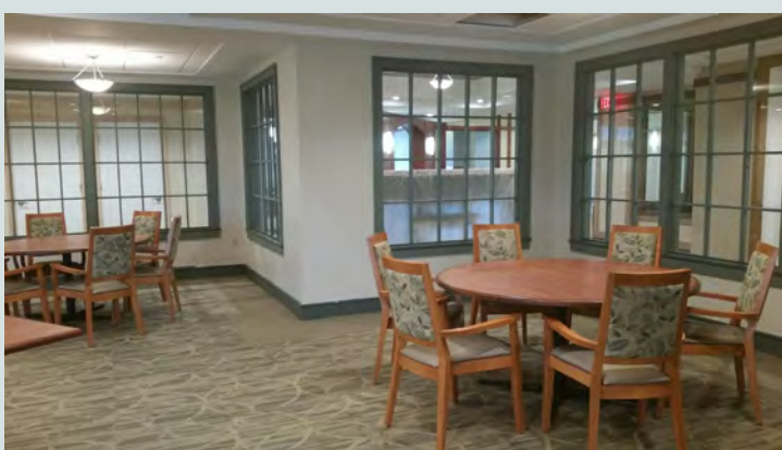
(Above Photo) The dining room is now filled with seating where our residents will enjoy delicious restaurant style meals.